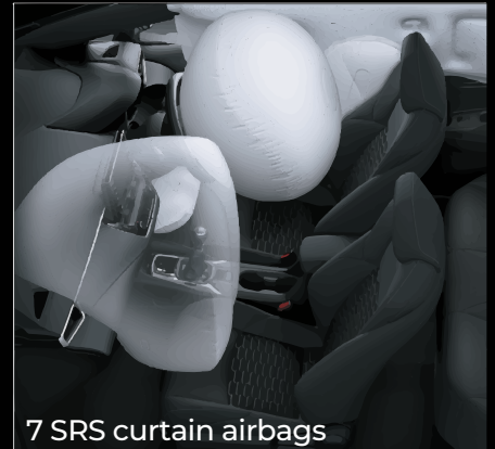
7 SRS curtain airbags